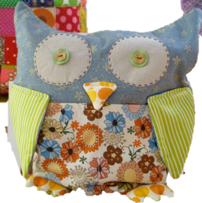
Hot water bottle textile cover