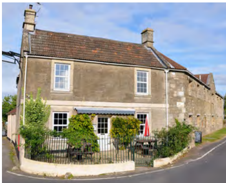
Bed & Breakfast